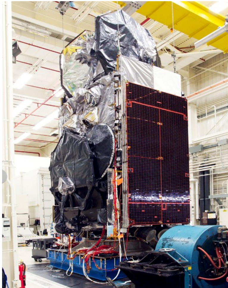
Fig 1: Vibration Testing Anik F2, Source: Telesat CA