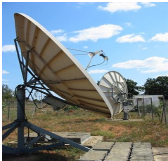
Fig 2: A C-band VSAT

Internet connectivity is normally achieved by sharing, with a large number of geographically dispersed sites, a link to a central location (the hub). The hub is normally placed in a highly connected region and operates as the main gateway to the Internet or other data services as voice, fax, or video conferencing.