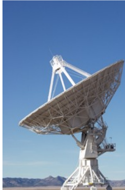
Fig 3: VSAT Antenna Ground Station